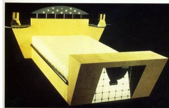
Figure 2 (b): more Michael Graves postmodern furniture.