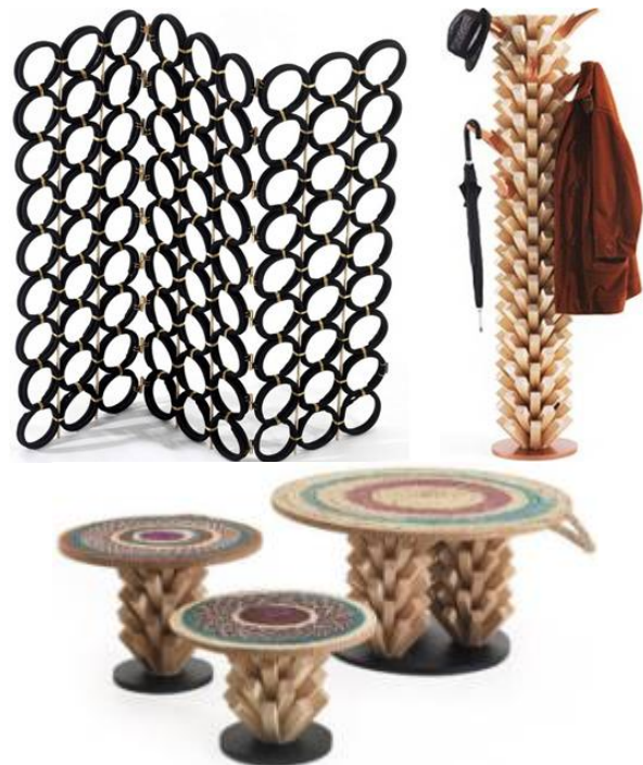
Figure 4: the work of furniture designer Khaled Shafar, using the traditional "iqal" and the palm tree trunk as composition elements.

Furniture industry has a strong potential to flourish if backed by strong design.