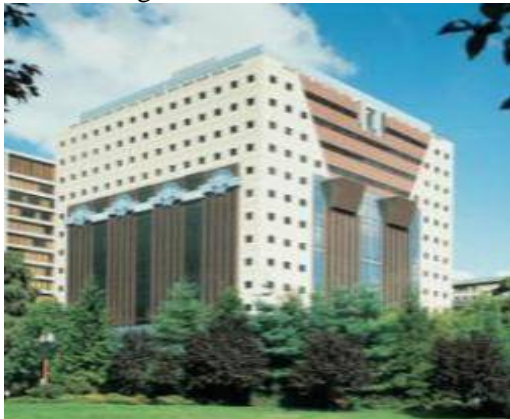
Figure 1: Portland building, Portland, Oregon 1983 by Michael Graves as an early example of Post-modern movement in architecture

Postmodernism postulates that many, if not all, apparent realities are only social constructs and are therefore subject to change. It emphasizes the role of language, power relations, and motivations in the formation of ideas and beliefs. Postmodernism's origins are generally accepted as having been conceived in art around the end of the nineteenth century as a reaction to the stultifying legacy of modern art and continued to expand into other disciplines during the early twentieth century as a reaction against modernism in general.