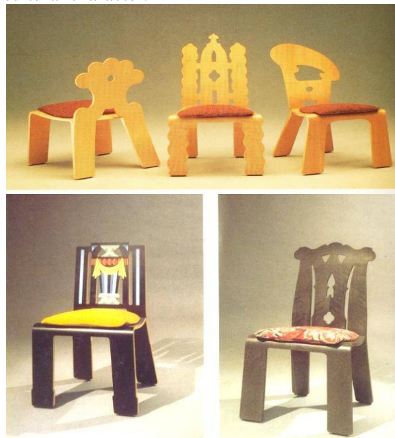
Figure 3: Robert Venturi, Sheraton, Chippendale, Biedermeier, gothic revival and art nouveau chairs, 1984 for Knoll

sociological sciences that are affected by the political, scientific and cultural background of those studying it. However, there is an academic consensus that defines the different aspects of folklore. Accordingly, it is generally defined as the collection of habits, traditions, morals, arts, crafts, skills that have been produced by the society over a long line of experiences that it has been spontaneously dealt with, governed by and learned among that society. In other words, it is safe to say that folklore contributes to the articulation of the identity of a society and its cultural character.