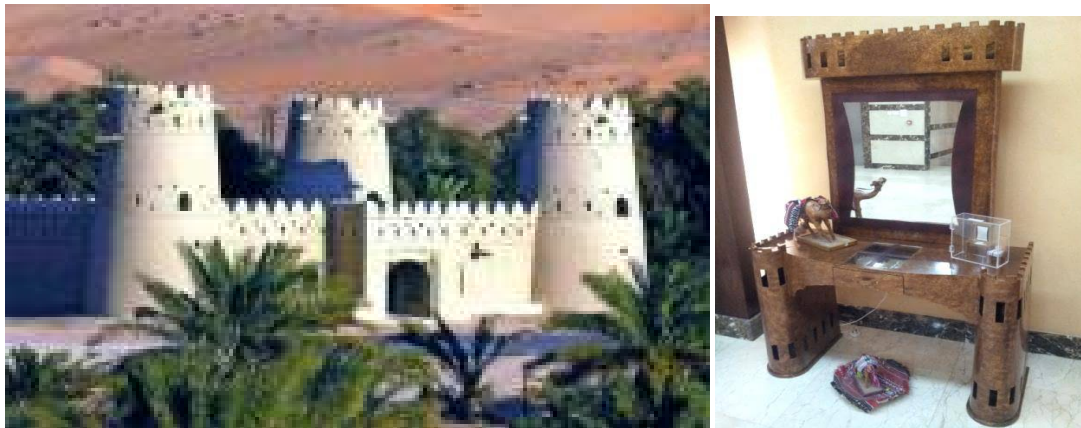
Figure 14: Architecture elements utilized as inspiration for ornamentation in this design for a console.