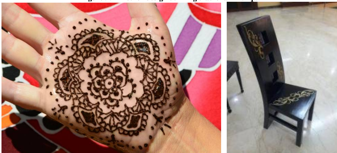
Figure 10: “Henna” patterns, women traditional makeup applied to hands has developed into very sophisticated designs. Those paterens were used to decorate chairs.