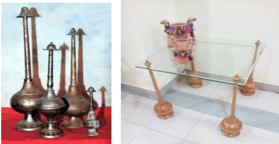
Figure 7: Metal perfume containers converted into a table with glass top.

The following includes samples of the produced student work