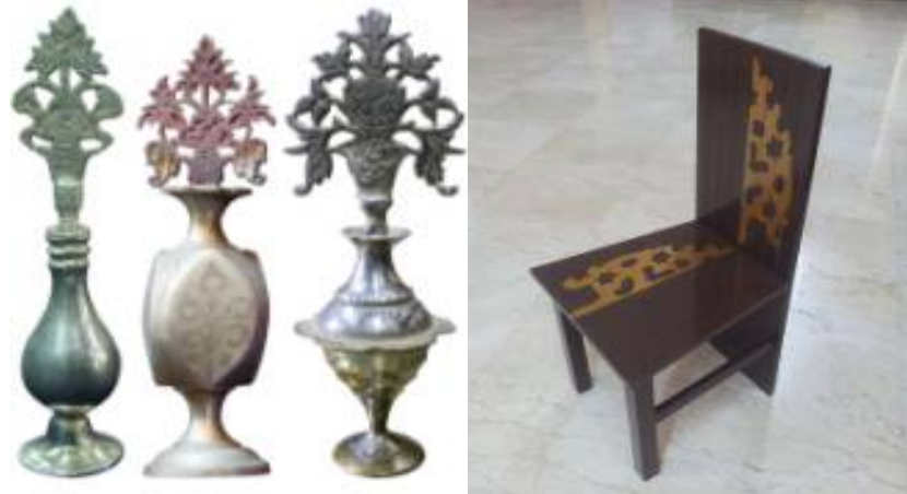
Figure 12: Traditional eyeliner bottle design used as a decorating pattern on chairs.