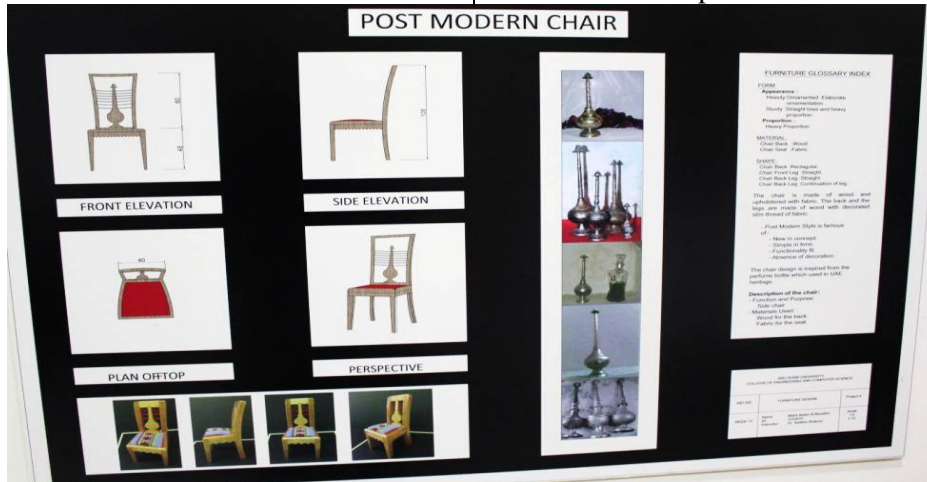
Figure 6: sample of the boards expected from the students after completing their assignment. The board shows the visual and textual analysis of the selected item, and presents the proposed design as colored orthographic projections with some photos of the approved study model.

According to the analysis done in the first phase, each student designed the furniture item then was asked to produce a simple scaled model with simple materials to test the success of the given design. After agreeing on the proposed design by the studio professor, students were requested to build a full scale piece.