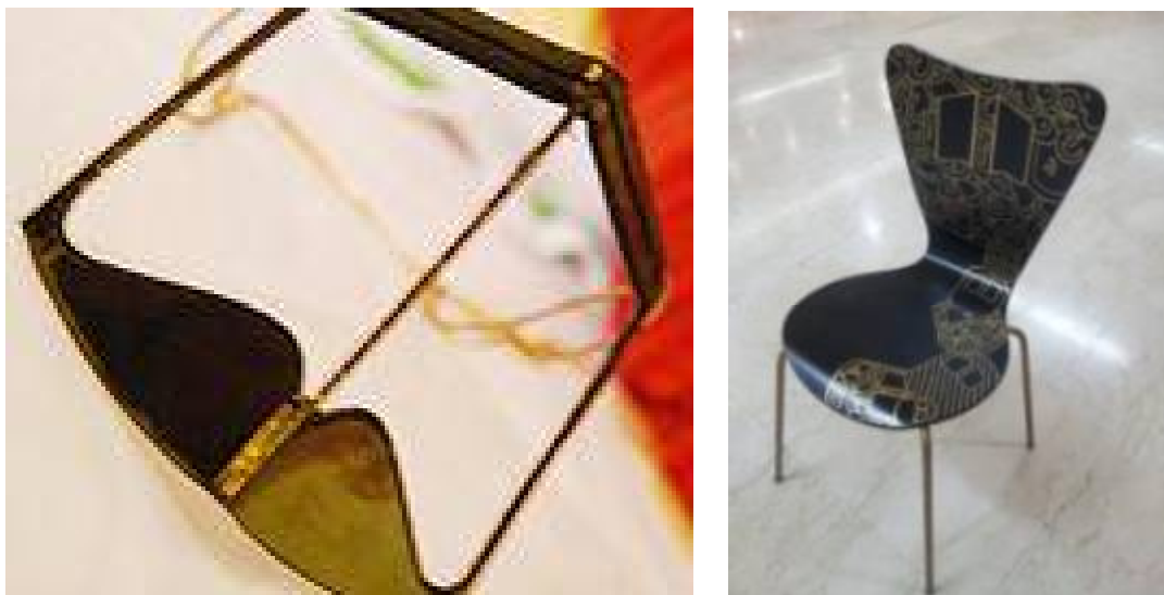
Figure 9: Another design utilizing tradional “Burqa”