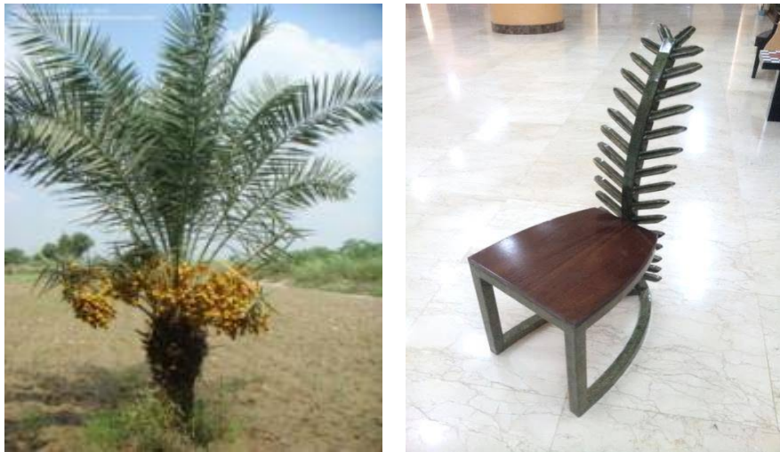
Figure 16: One of the most treasured plants of desert is the palm tree which has been traditionally used for all life purposes. The palm frond has been converted into a chair.