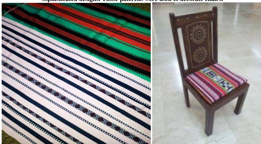
Figure 11: UAE fabrics and textiles