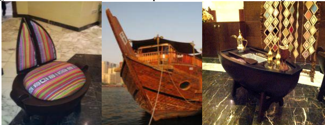
Figure 15: The traditional Emirati boat has a very strong visual image and has been utilized to create a coffee table.