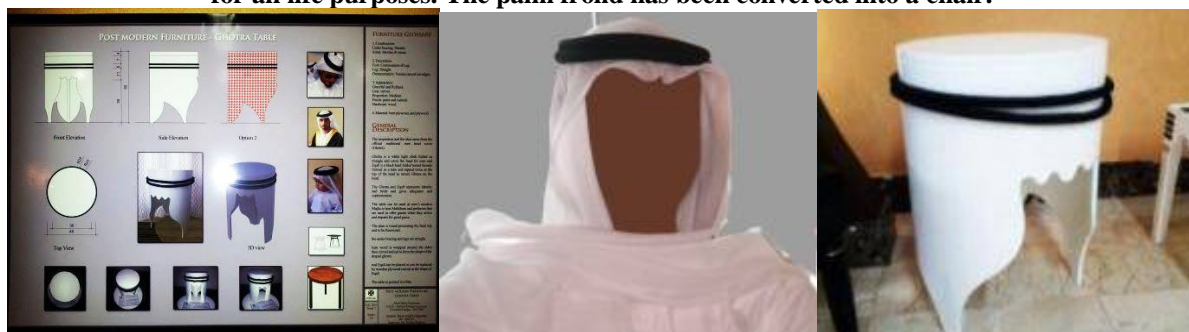
Figure 17: The traditional "iqal" and "Ghutra" inspired in this side table.