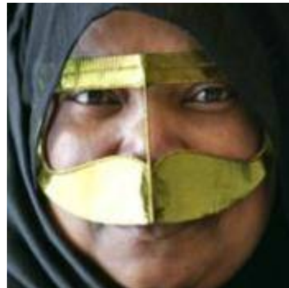
Figure 5: Some of the Emirati iconic heritage elements that has been used in this research; jewelry, boats, burqa, etc..