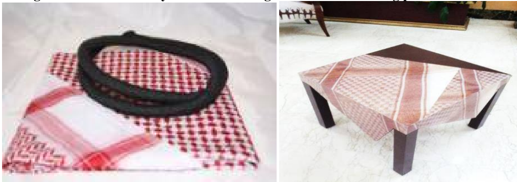
Figure 13: The traditional "iqual" and "Ghutra" converted into a pattern for a coffee table. The feeling of the cloth is used as a side element of the table.