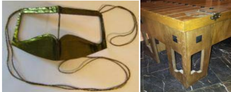
Figure 8: Traditional women burqa has been converted into a coffee table, using the curvy lines to shape the vertical support elements.